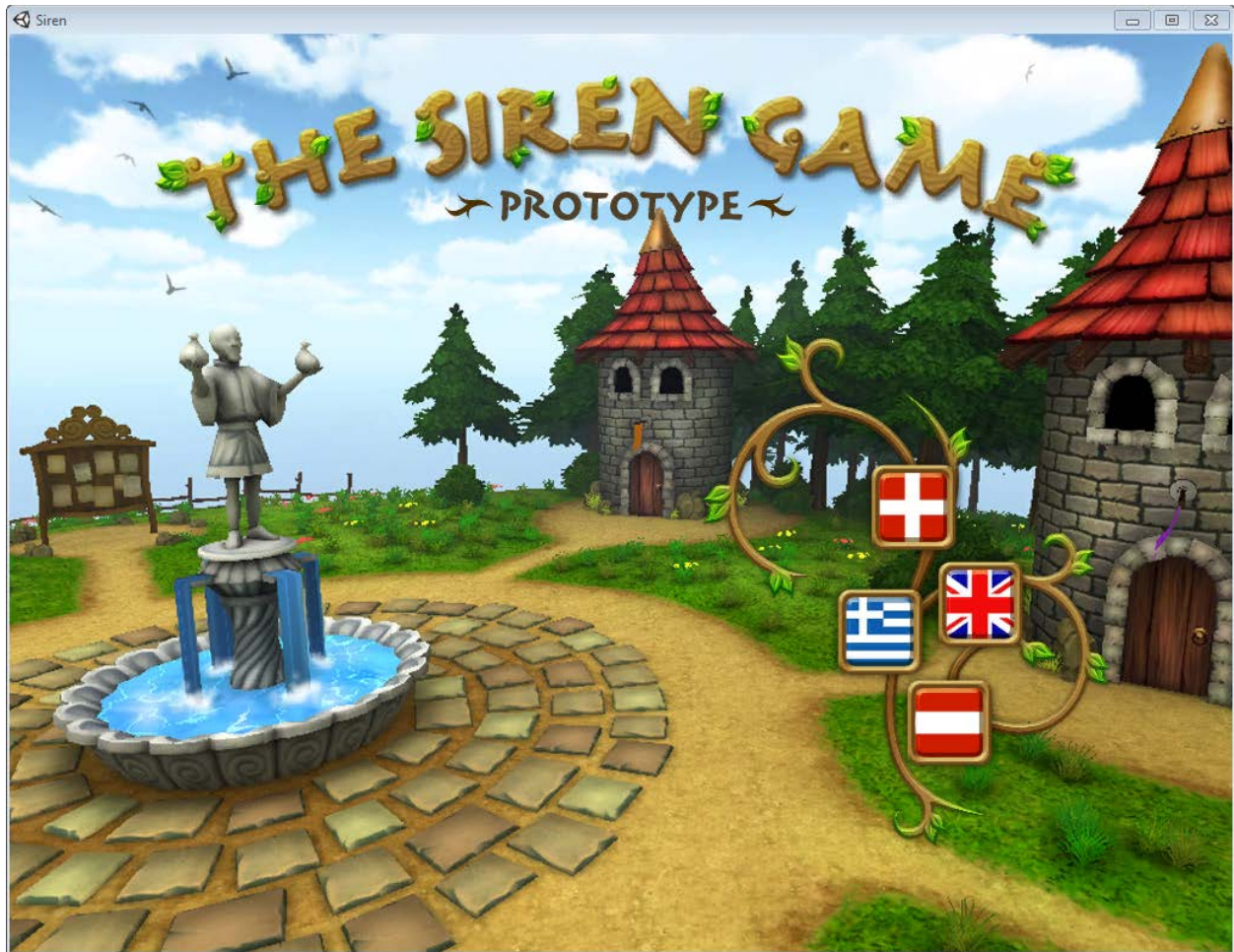
6 This is the next screen